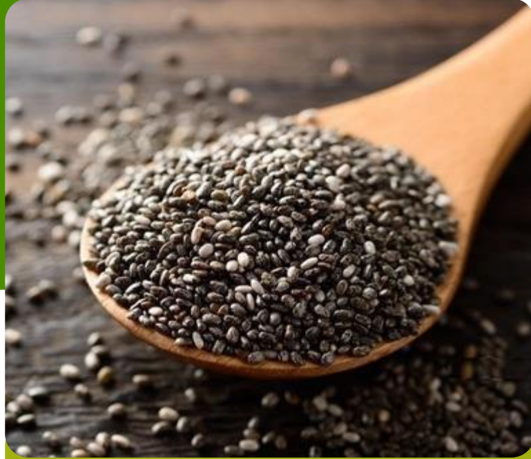
ORGANIC CHIA SEEDS