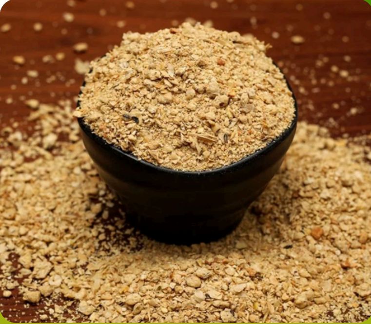
NON-GMO SOYBEAN MEAL