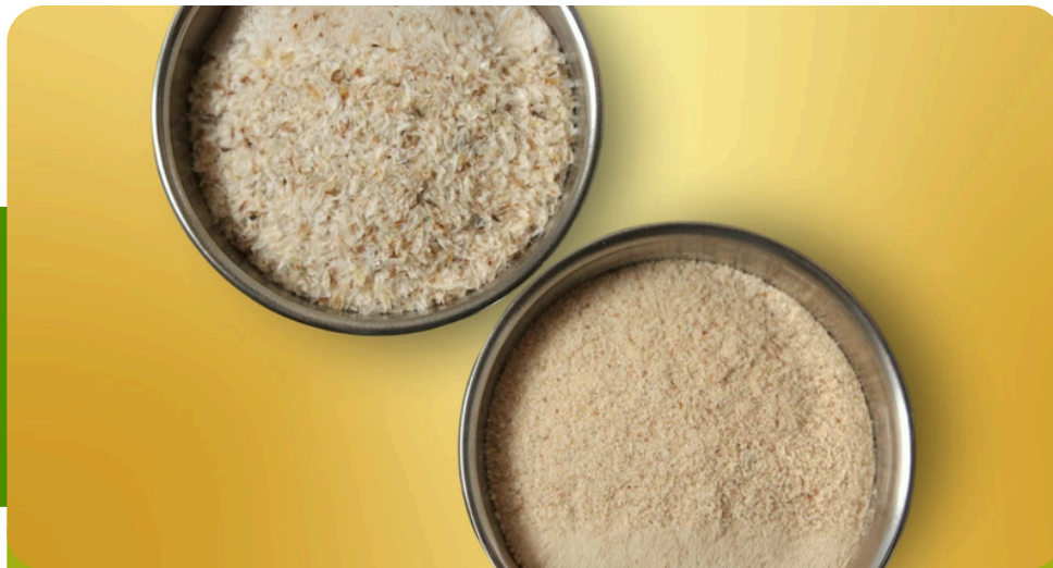
PSYLLIUM HUSK WHOLE (99% PHARMA GRADE)

Premium Bio Staples: Non-GMO Soybean Meal, Psyllium Husk 99% Pharma Grade, Organic Chia Seeds Export.