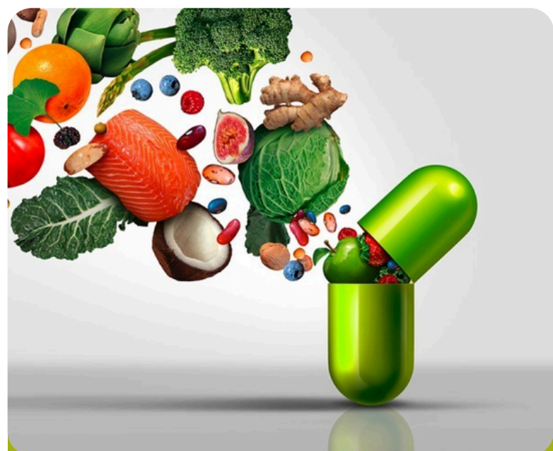
FOOD & FUNCTIONAL FOOD INDUSTRY