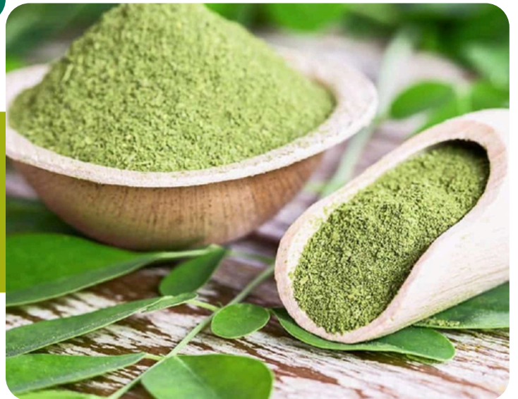
MORINGA SEED EXTRACT